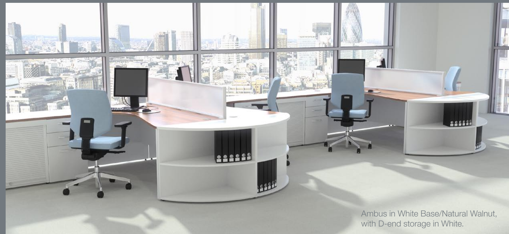
Ambus in White Base/Natural Walnut, with D-end storage in White.