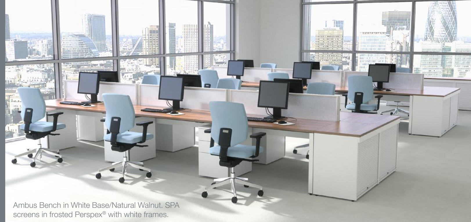
Ambus Bench in White Base/Natural Walnut. SPA screens in frosted Perspex® with white frames.